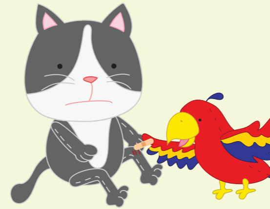
Pat is helping to put a plaster on Cathy's cut.